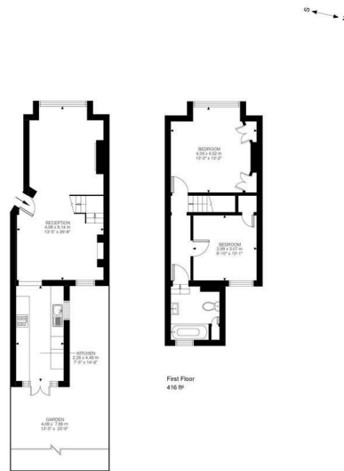
Ground Floor 444 sq ft